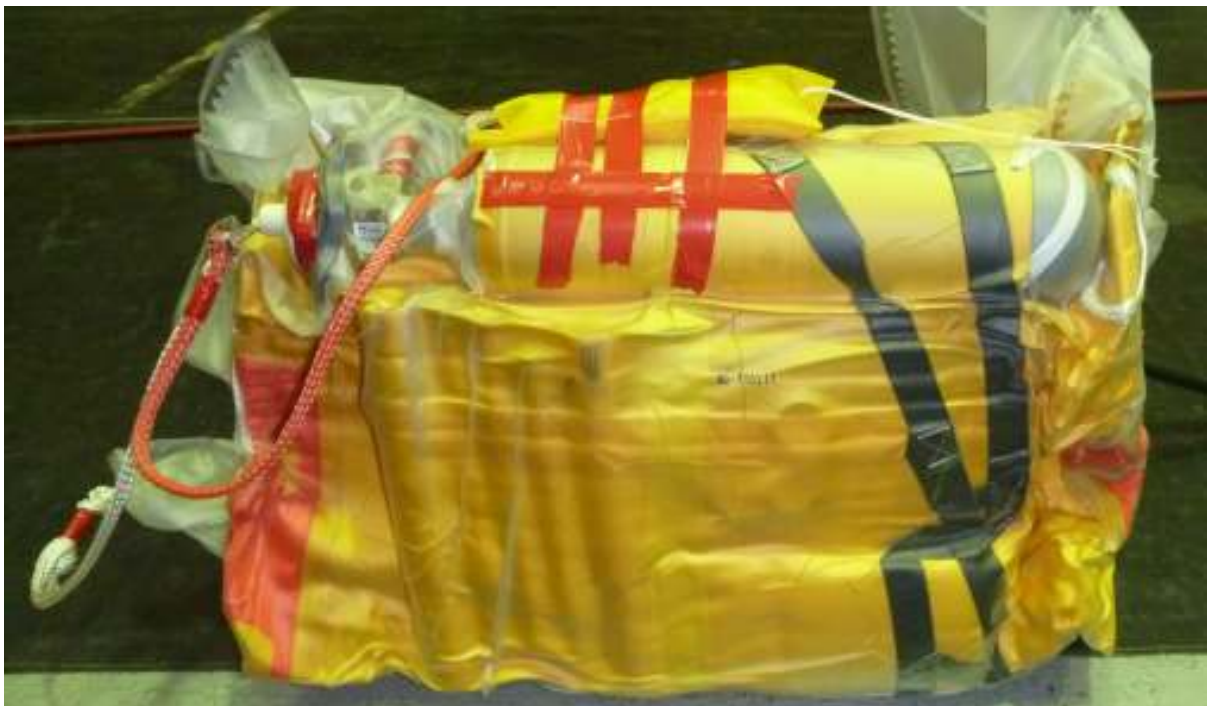
Fig 2 – Vacuum Packed Liferaft

With the position of the cylinder confirmed, locate the vacuum packed liferaft into the lower half of the container. Once located ensure that there is space between the inner face of the container and the top of the operating head. Fig 3 refers.